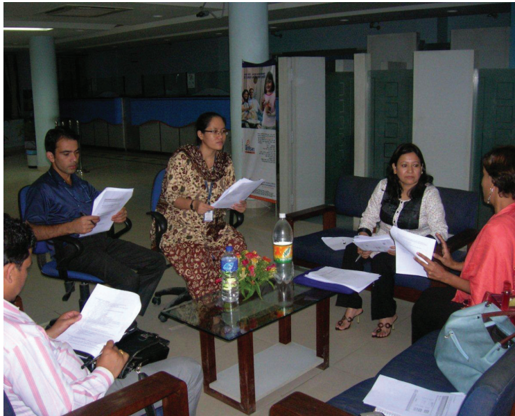
Staff at Bank of Kathmandu's Gongabu branch participate in a training on the new Chetansil Yuwa Bachat Yojana account.

Savings have been associated with better mental health, educational attainment, and less-risky sexual attitudes and behaviors.